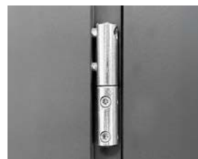
Ø20 drill-in hinges, 3D adjustable, zinc white, fitted to FIRE RATED SILENZIO HAL 32, SILENZIO HAL 32 and SILENZIO 46/43/42 as standard