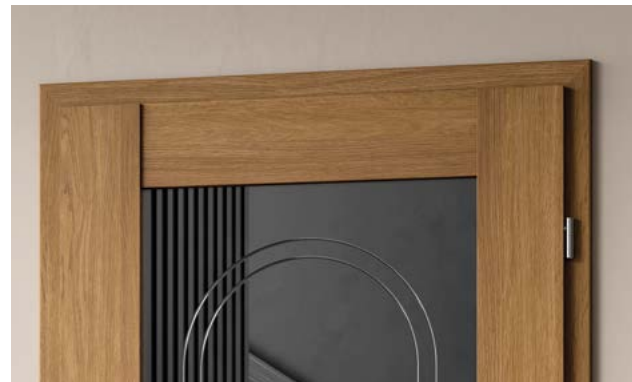
INTERIOR DOORS IN REBATED DOOR SYSTEM