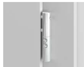
Ø16 drill-in hinges, 3D adjustable, zinc white, fitted to SOLID PLUS and SILENZIO 32/31/29 doors as standard