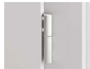
Reinforced Ø13.5 drill-in hinges, in zinc white, fitted in the BRILLIANT, ELEGANTE and PRESTIGE collection as standard