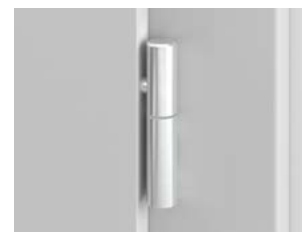
Ø15 drill-in hinges, in zinc white, fitted in the BASIC collection as standard