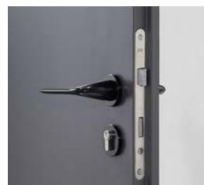
Mechanical key lock